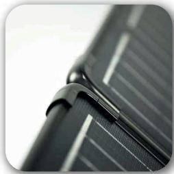
— product details —